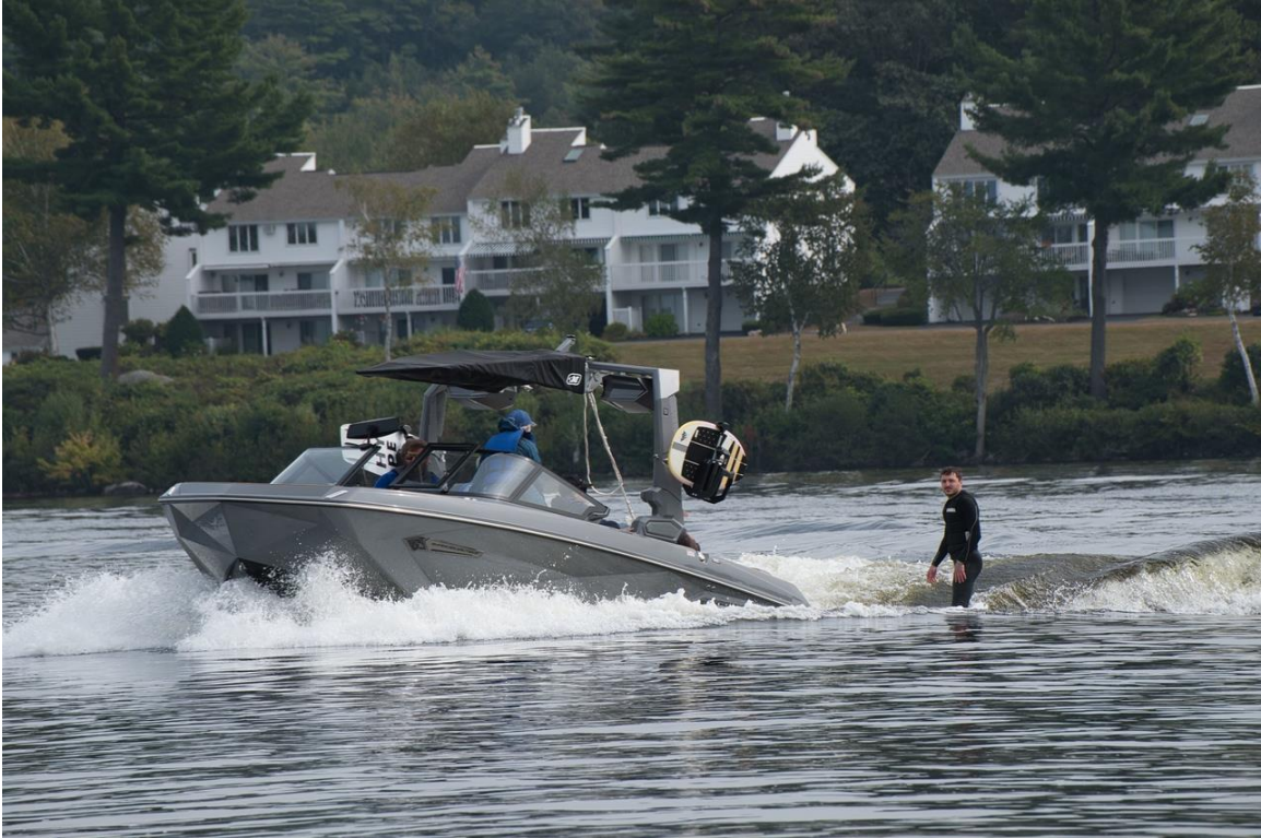
2023 Nautique G21 in wakesurf configuration with wakesurfer rider on side closest to Long Lake Marina dock.