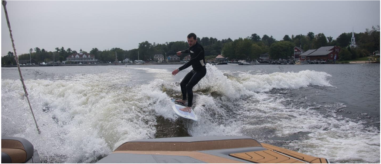
Rider performing a carving maneuver on the wave.