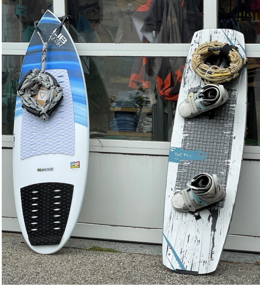
Example of surf board and surf rope (LH) and wakeboard and wakeboard rope (RH)