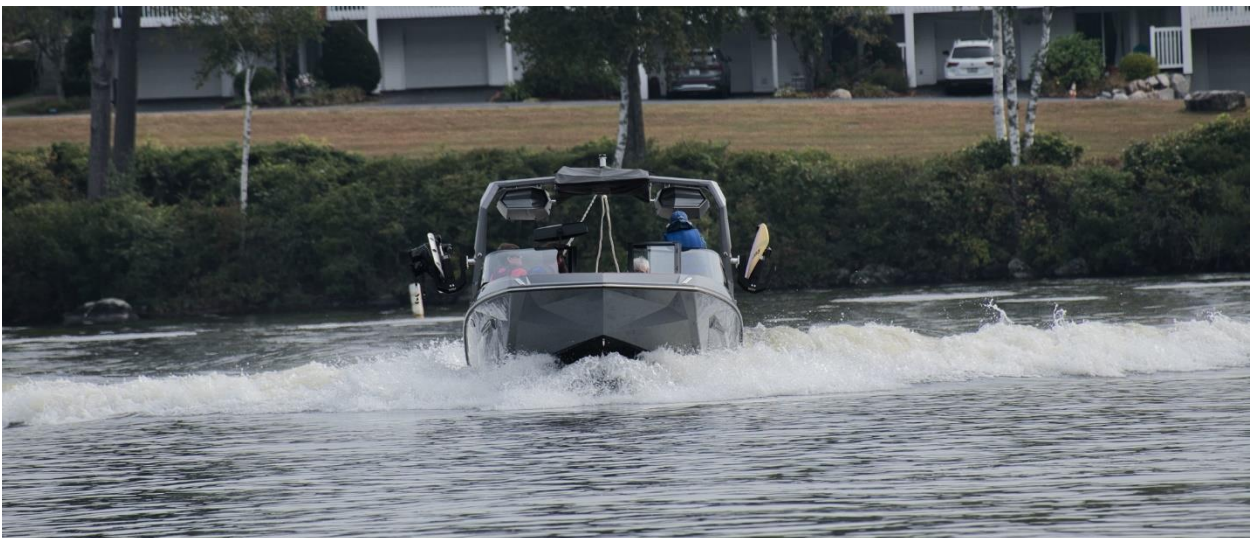
2023 Nautique G21 bow view in wakesurfing mode.