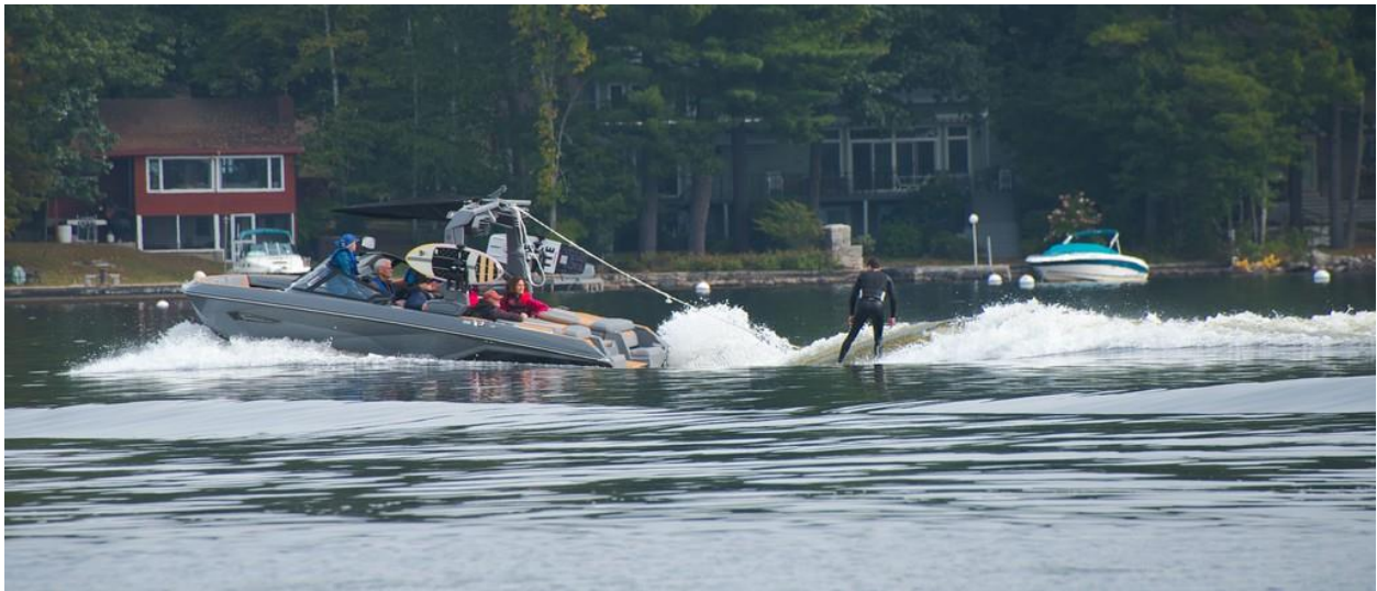
Additional photo of rider wakesurfing behind the 2023 Nautique G21.