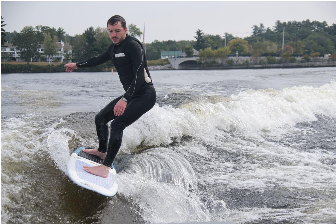
Rider performing a carving move on the wave.