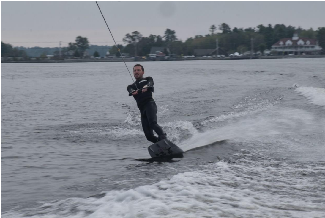
Rider wakeboarding behind the 2023 Nautique G21.