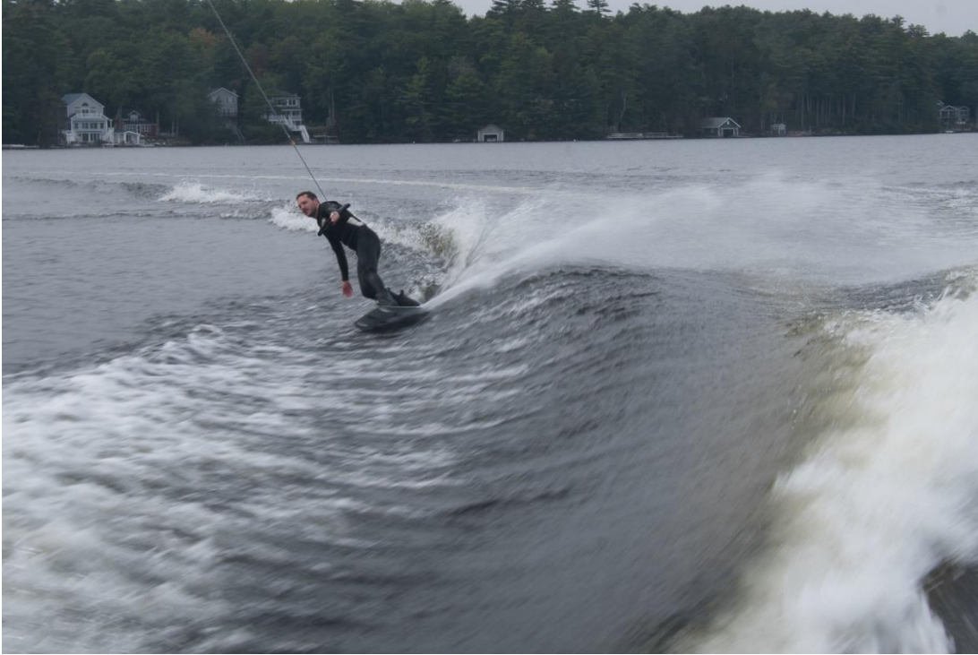
Rider wakeboarding behind the Nautique G21.