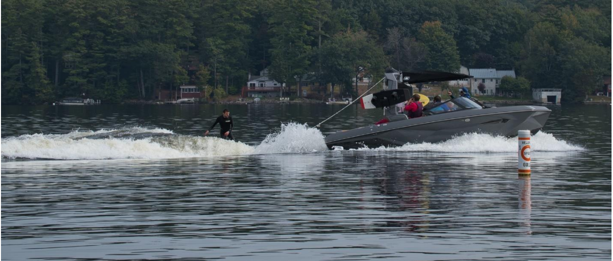
2023 Nautique G21 being utilized in “wakesurf mode”. Wakesurf mode consists of full ballast, speed set for 11.6 MPH, surf system deployed. Surfer has successfully dropped the rope and is not attached to the boat.