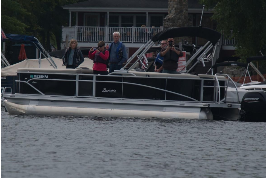
Pontoon boat used as a placeholder to set the various distances cited in the various studies.