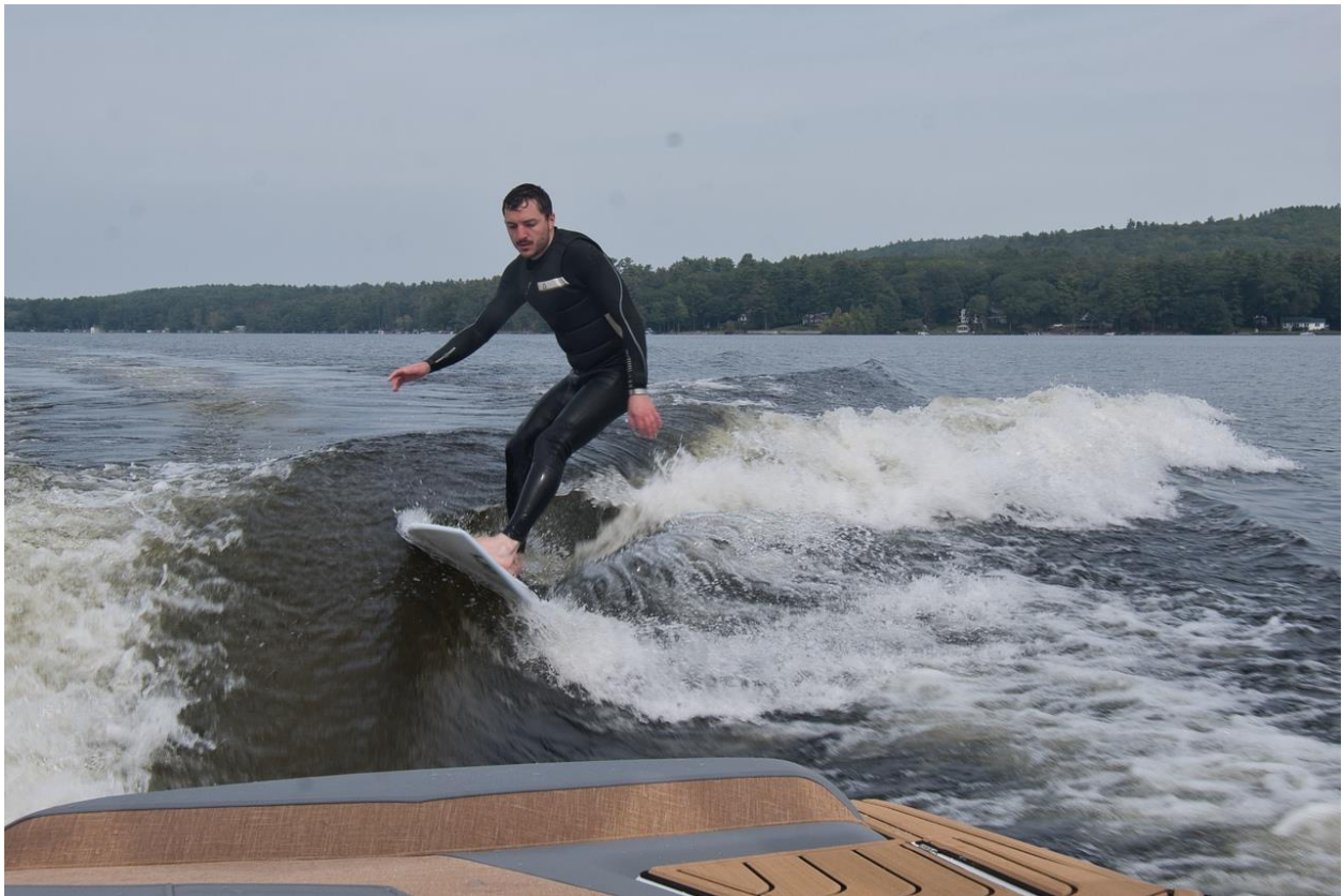
Close up of wakesurf wave on 2023 Nautique G21.