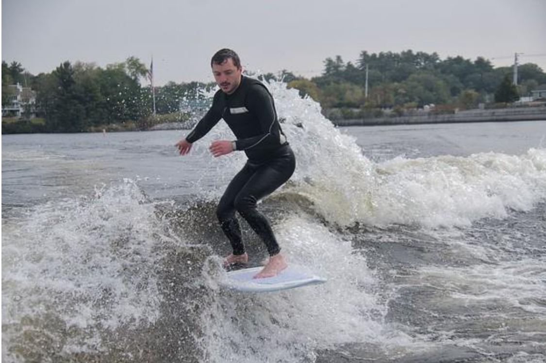
Rider on rear part of the surf wave.